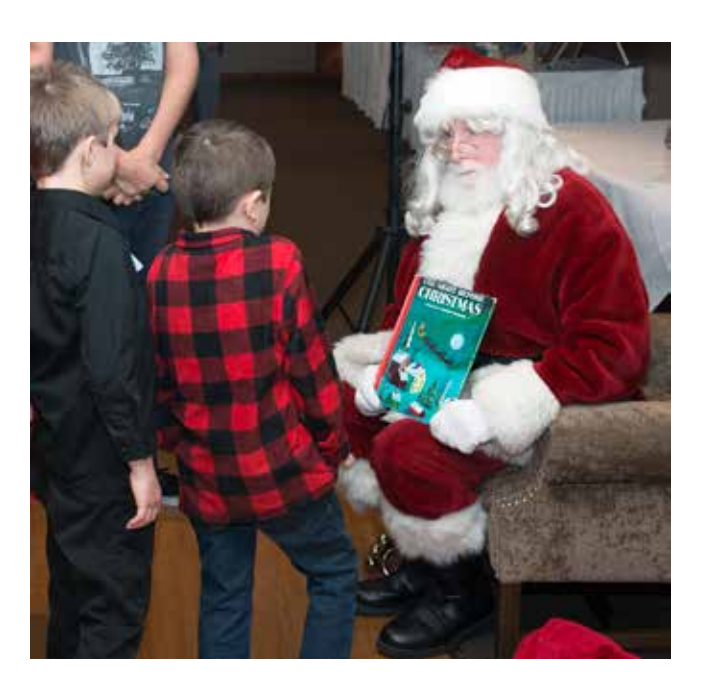
The December clinician aimed his message toward a younger crowd but was appreciated by everyone.